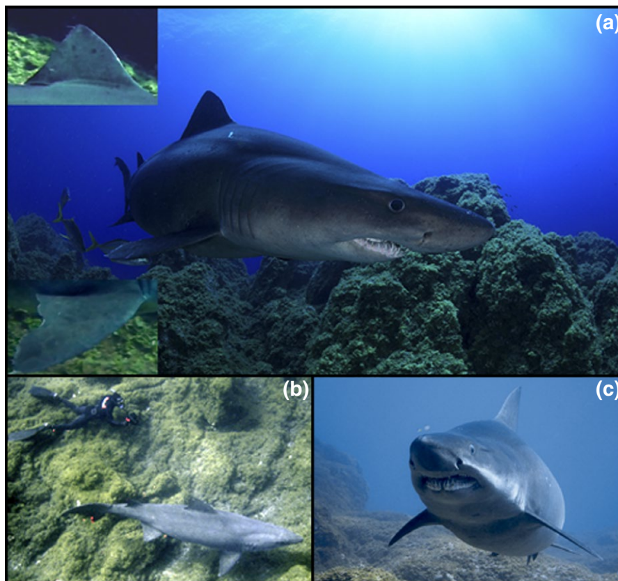
FIGURE 2 Odontaspis ferox “Ofe_1” observed in 2005, 2010 and 2016 in El Hierro. (a) Detail of the body characters used for specimen identification, (b) next to a diver for size estimate based on length comparison, (c) showing a distended abdomen indicating that it may be pregnant

(4 hr), at depths of 1–10 m. Both of them were swimming peacefully around the area during the encounters; and seemed not to be bothered by the presence of divers. Although they changed slightly their velocity when they felt observed, swimming slowly away but remaining in the same area. A third encounter with a female O. ferox named Ofe_3 occurred during July 2006, at depths of 7–10 m. This female had a fearful behaviour, swimming away to the deep when it noticed the presence of divers. The second encounter with Ofe_1 took place from mid-July to beginning of August 2010; at the same time a fourth female specimen, named Ofe_4, was observed. The depth of the observation ranged from 3 to 10 m. Both females presented behaviour between quiet and distrustful against divers. The third encounter with Ofe_1 occurred from July to September 2016. The observation of this specimen took place at depths of 3–20 m. In this last encounter, the female showed an easily frightened behaviour; swimming around on a fairly large area, sometimes in shallow waters and most of the time